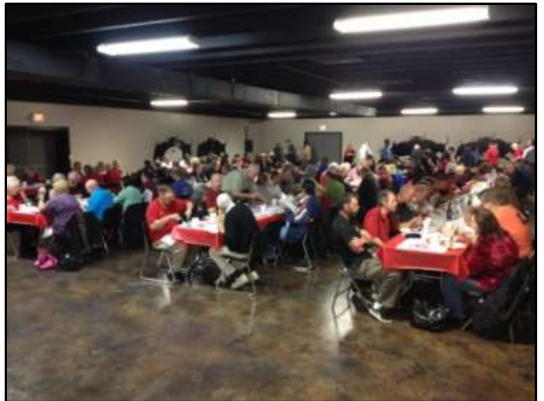
SASBA Awards Banquet During Annual Team Tournament at Cowtown Bowling Palace