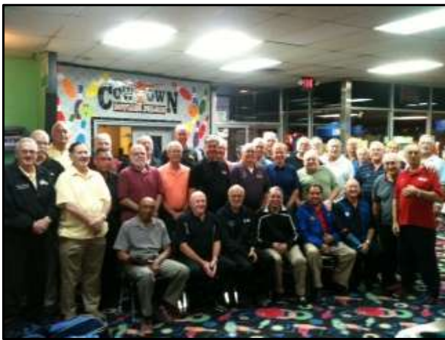
72 SASBA Members bowled in the Over 60/Over 70 Doubles event held at Cowtown Bowling Palace in Ft Worth, TX